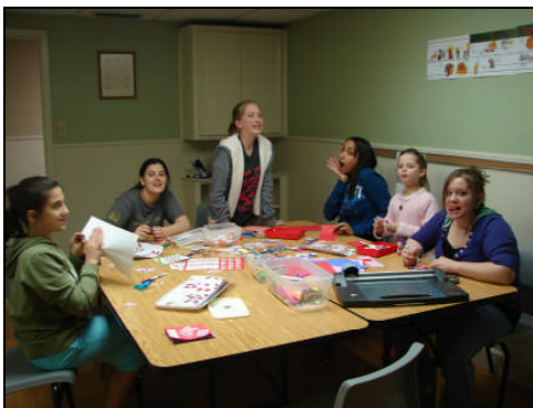
Making Valentines for kids in hospital.

THE WOMEN'S MINISTRY INVITE YOU TO A SOUP & SALAD SUPPER ON WEDNESDAY, MARCH 18, 5-5:45 PM, PRIOR TO WEDNESDAY EVENING SERVICE. COME, AND BRING A FRIEND!